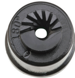
8 jets (180° Option) Perfect for landscape applications for placement on the edge to irrigate garden beds while keeping footpaths dry