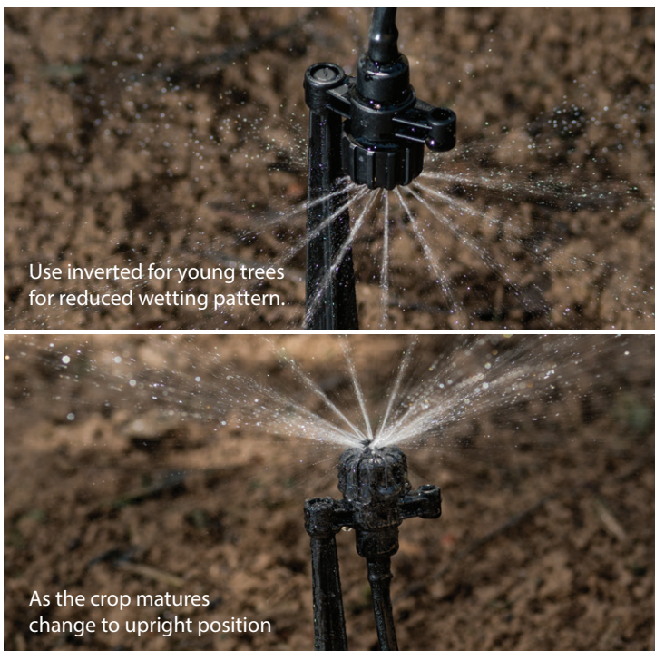
Use inverted for young trees for reduced wetting pattern.